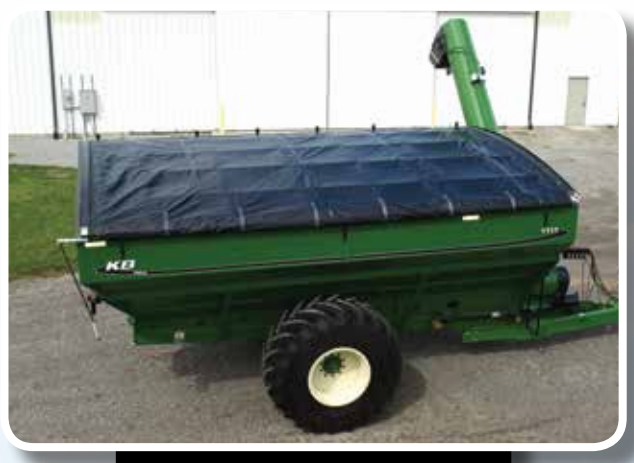
Weatherguard rollover tarp