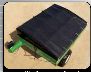
Weatherguard rollover tarp