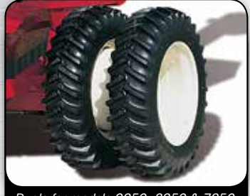
Duals for models 9250, 8250 & 7250