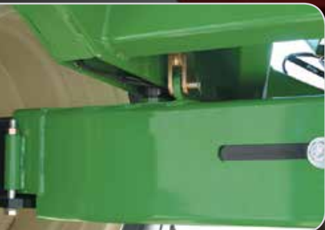
Width-adjustable tubular steel axle (optional)