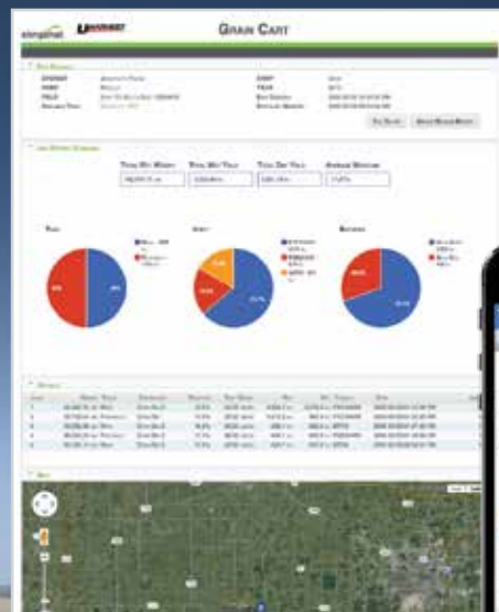
Harvest reports with a single click from any location