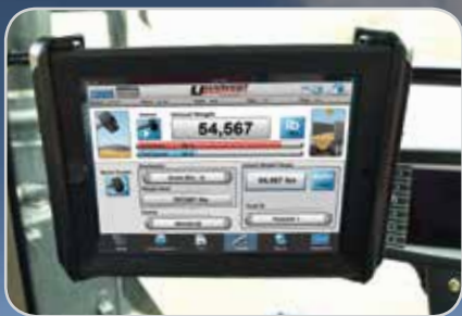
Complete touch-screen operation