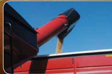
Standard 60° turret-style downspout for maximum unloading control.