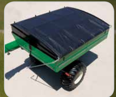
Weatherguard self-locking tarp