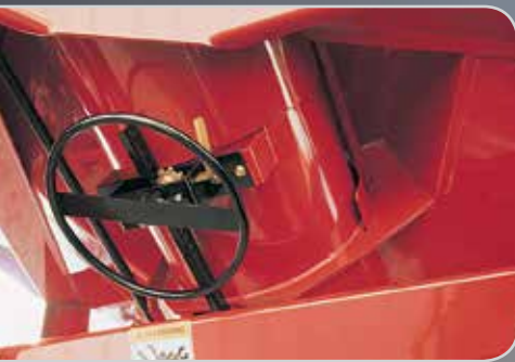
Lockable, wheel-operated cleanout door