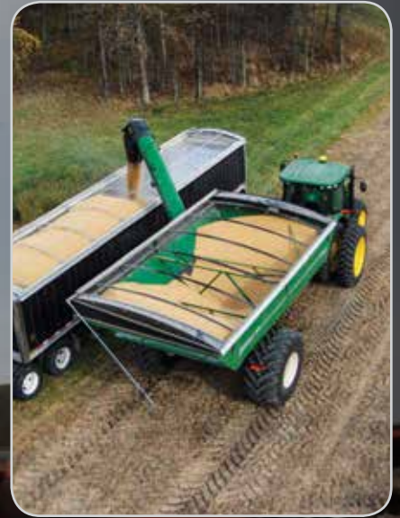
60° rotating downspout for precise unloading control

With capacities ranging from 1,200 bushels to 750 bushels, there is a size available for every operation.