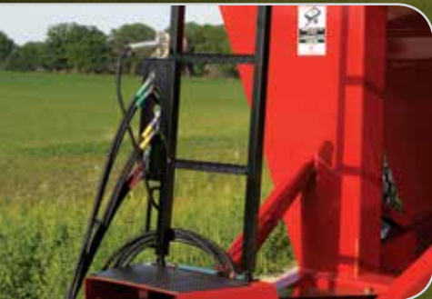
Color-coded hydraulic hoses