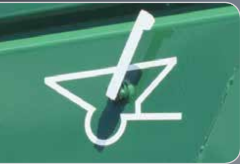
High-visibility auger position indicator

By any measure, Brent grain carts deliver optimum value. Our 35-year plus history is rich with design innovations that make your harvest — from start to finish — as smooth and stress-free as possible.