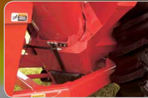
22-20 turbo-charged unloading auger