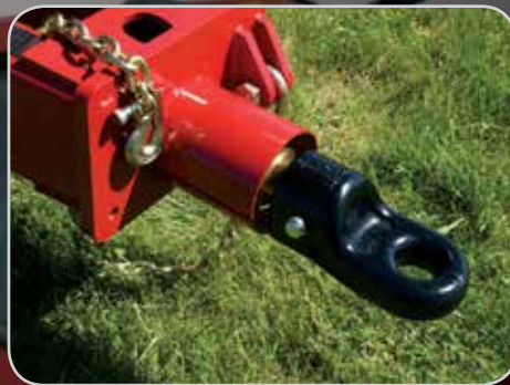
Cast single-tang hitch