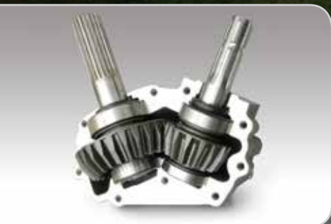
Exclusive 45° gearbox