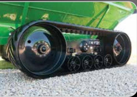
Available with cleated rubber tracks with hydraulic tensioning

In addition to having the widest variety of undercarriage options, the Brent chassis design ensures smooth performance and stable towing whether traveling down the road or over the roughest field terrain.