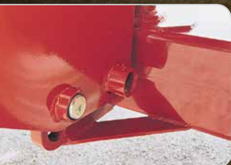
Adjustable tongue weight (Models 1082-782)