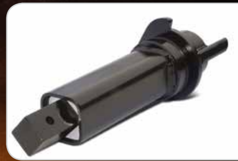
Soft-start auger mechanism