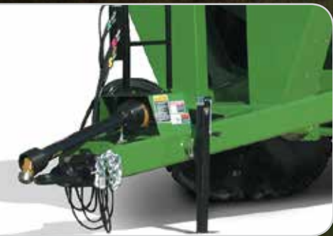
Shearbolt or friction clutch-protected PTO

Brent grain carts outlast and outperform any other grain cart you can own. Durable steel construction, truss frame design and oversized, heavy duty power-train components mean years of dependable and low-maintenance service.