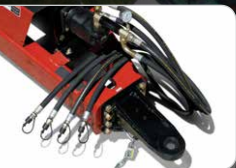
Optional multi-port hydraulic drives