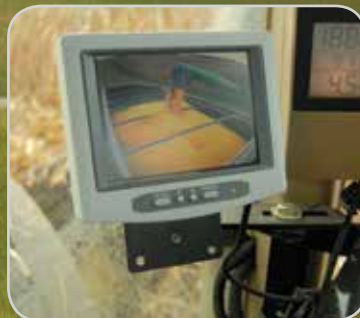
Cab-mounted color monitor