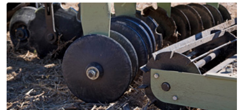
ADJUSTABLE DISC GANGS