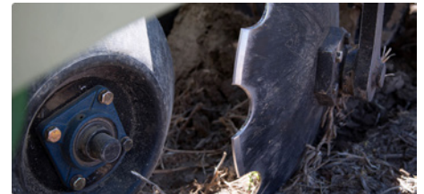
22" NOTCHED DISC BLADES