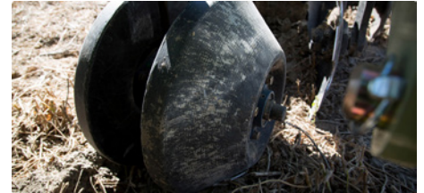
ADJUSTABLE GUIDE WHEEL