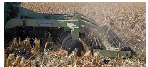
DUAL REAR ROLLING BASKETS