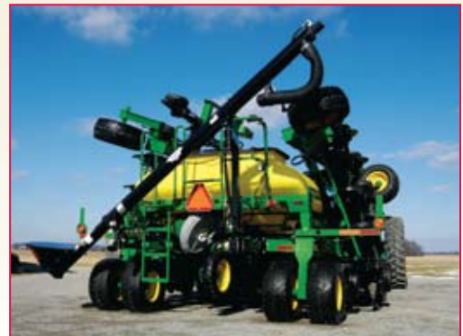
• Drill Fill for model 1990 CCS in transport position