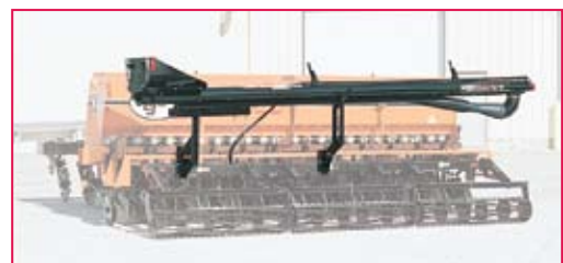
• Drill Fill for Tye Series V drills in transport position