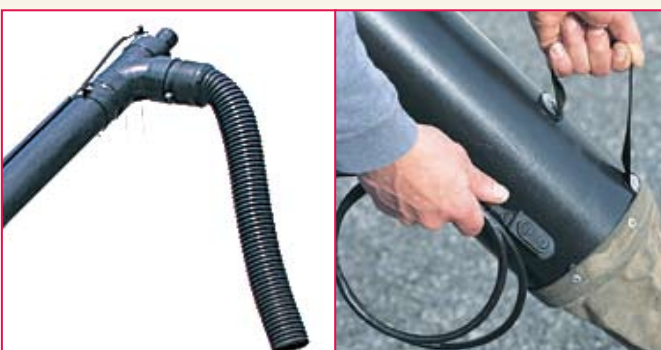
Standard neoprene downspout