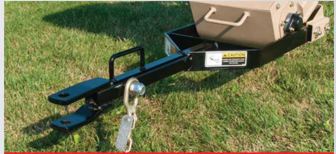
Tool-free hitch removal