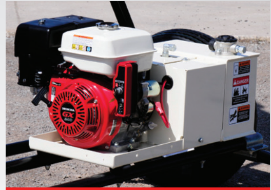
Power-pack hydraulic unit