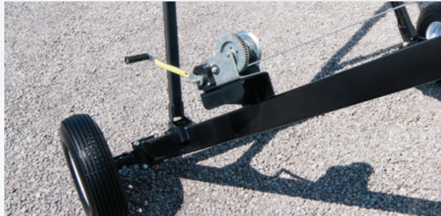
Friction disc winch