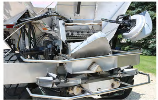
AIR COMMAND™ SECTION CONTROL