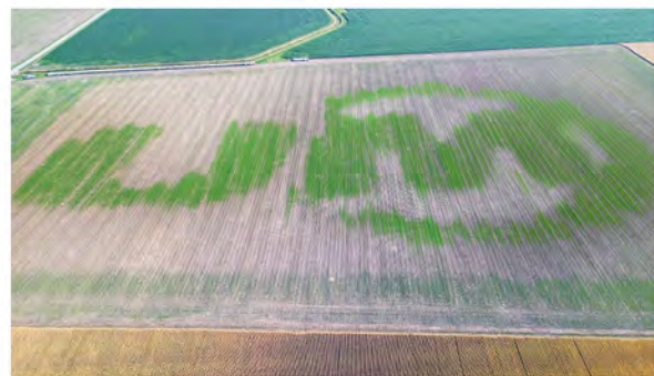
AIR COMMAND COVER CROP SPREAD RESULTS