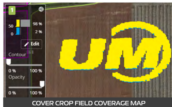
COVER CROP FIELD COVERAGE MAP