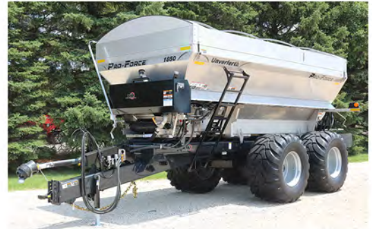
MODEL 1850 WITH PTO DRIVE