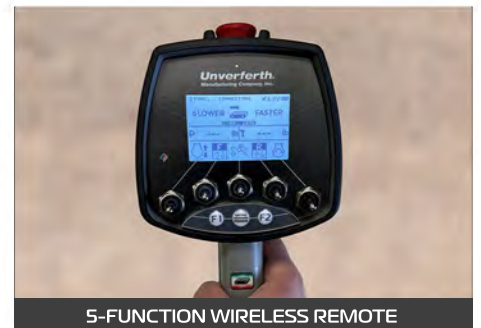
5-FUNCTION WIRELESS REMOTE