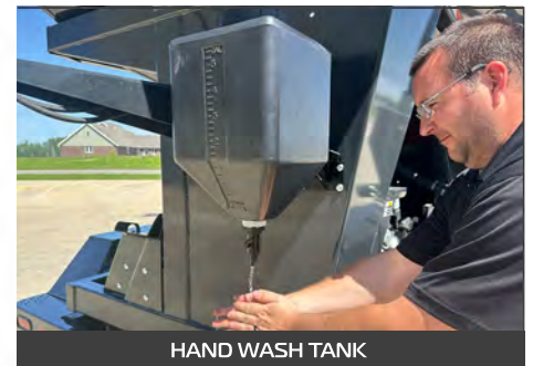
HAND WASH TANK