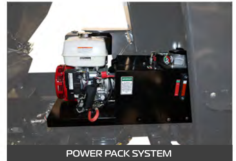
POWER PACK SYSTEM