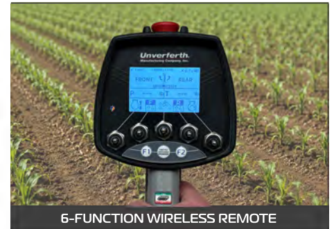
6-FUNCTION WIRELESS REMOTE