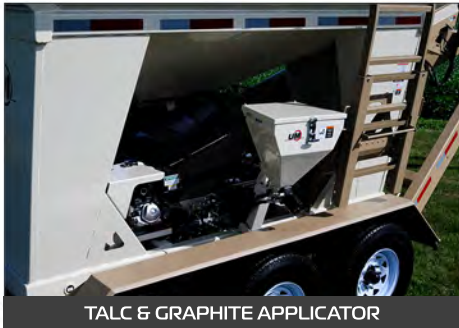
TALC & GRAPHITE APPLICATOR