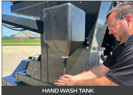
HAND WASH TANK