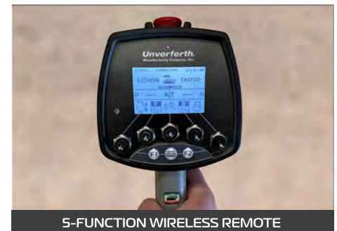
5-FUNCTION WIRELESS REMOTE