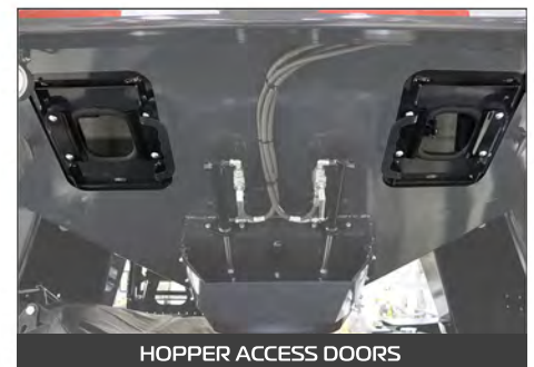
HOPPER ACCESS DOORS