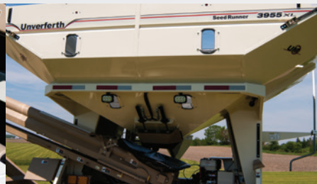
Windows and lights for fill level