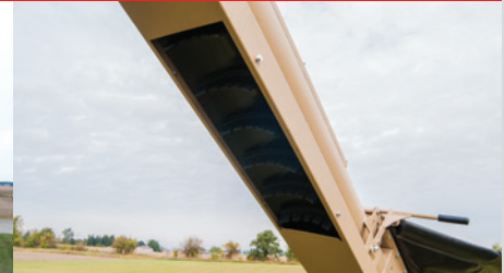
Access panel with tool-free removal