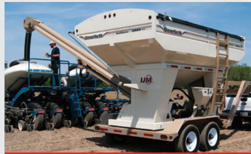
Direct to planter or drill