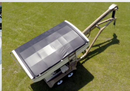
Durable, 18-oz. rollover tarp