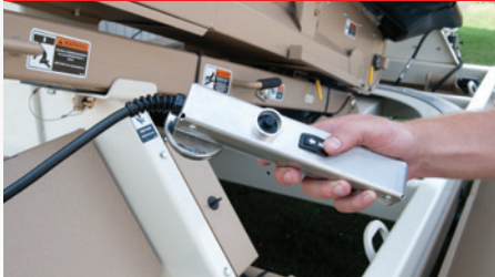
Standard wired remote control