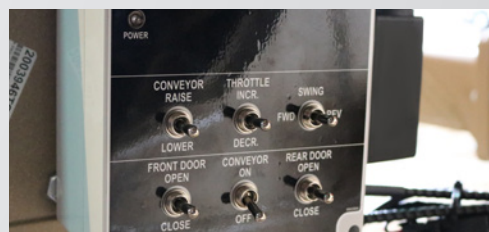
Manual override switch controls