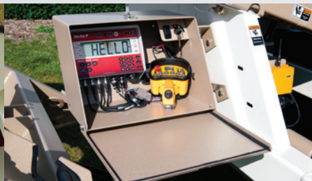
Spacious control console