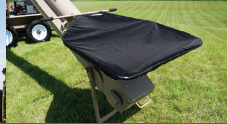
Canvas hopper cover