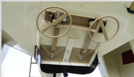
Large door openings