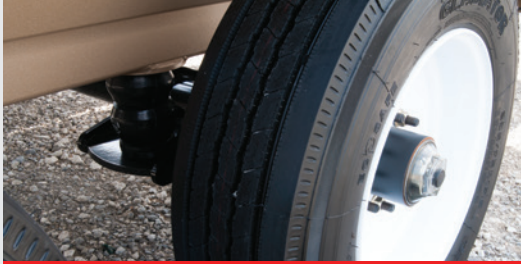
Oil bath hubs on 4955DXL, 3955DXL and 3955 XL