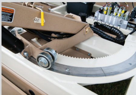
Turntable features 3/4" increments