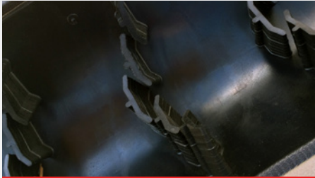
Cupped rows of offset cleats