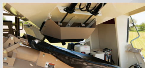
Hydraulic door-opening controls