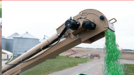
Adjustable rounded discharge hood