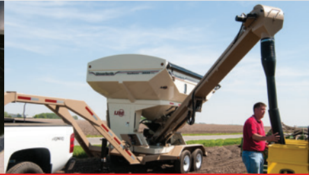
2-stage telescoping downspout