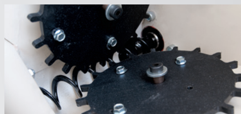
Smoother material flow