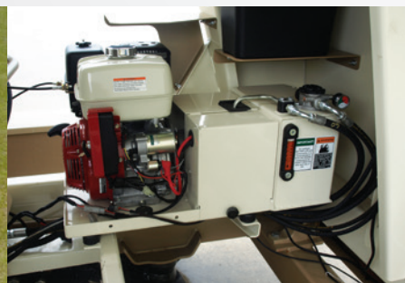
Electric start engine