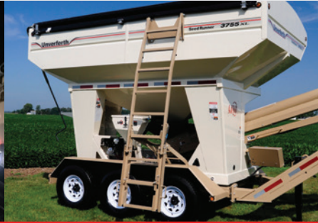
20" gas-strut lift-assist ladder