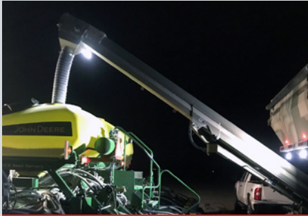
LED worklight package