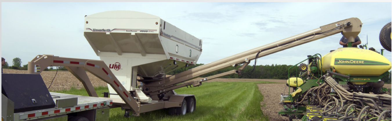
Low-profile, gentle conveyor design for easier, smoother self-filling

The original patented, self-filling dual-compartment Unverferth Seed Runner bulk seed tender set new standards for functional design innovation when first introduced in 2006. Unverferth design innovation continues with the 55-Series Seed Runner tenders for the gentlest seed handling yet, including corn, soybeans, cotton, peanuts and wheat. And they're available in capacities from 500 seed units to 275 seed units to match your operational needs.