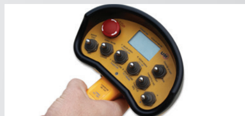
7-function handheld wireless remote