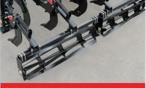
Available 16" bladed roller with high-carbon steel blades to shatter larger clods, chop and help distribute residue

The shanks are followed by your choice of three leveling options: