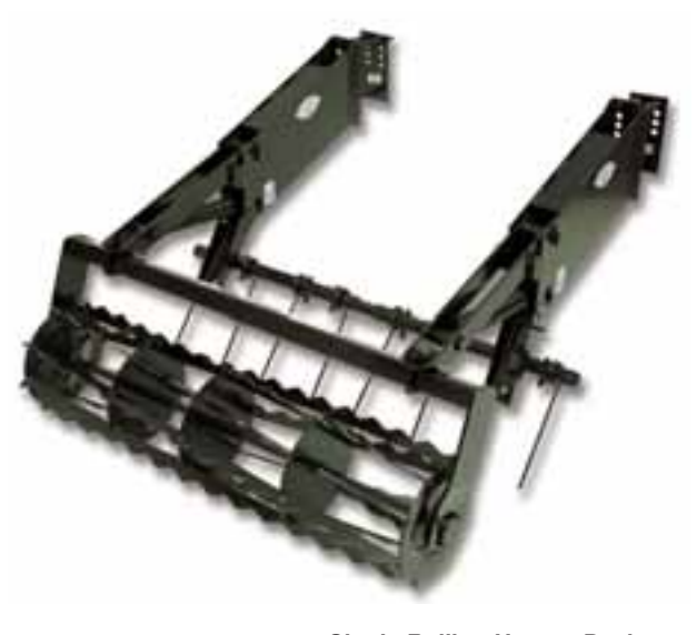
Single Rolling Harrow Basket