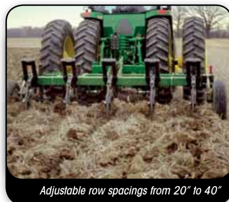
Adjustable row spacings from 20" to 40"