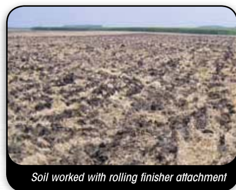
Soil worked with rolling finisher attachment

Shank stagger kit for positioning shanks 16" rearward for increased residue flow