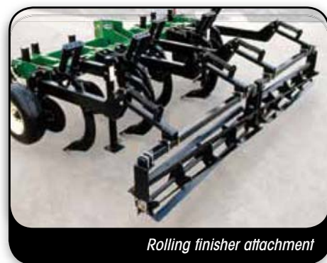
Rolling finisher attachment