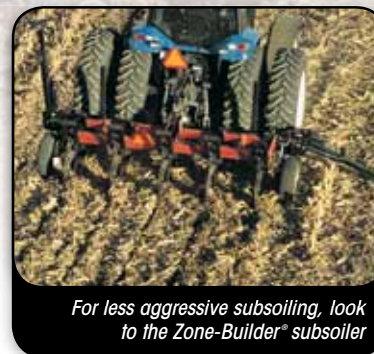
For less aggressive subsoiling, look to the Zone-Builder® subsoiler

*Reduce transport width approximately 3' when stabilizer wheels are positioned behind rear frame between two outer shanks.