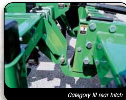
Category III rear hitch