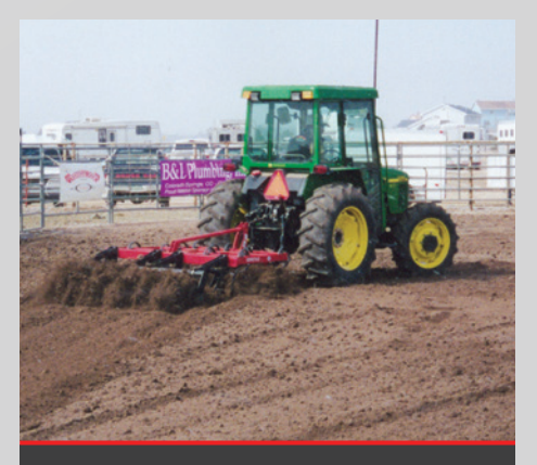
The Perfecta tool is flexible and versatile. It's perfect for track and arena grooming.

FOR COMPLETE DETAILS ON THE PERFECTA FIELD CULTIVATORS