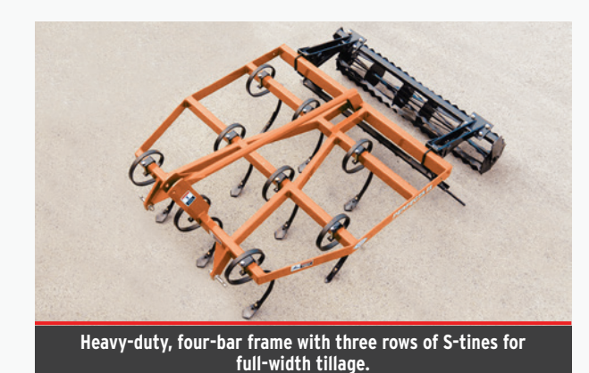
S-tines till from 2" to 6" deep and are available in three models

Plain and simple, you'll build the perfect seedbed with the Perfecta® field cultivator. Save fuel and time by tilling, leveling and finishing in a single pass. It's ideal for row-crop, orchard, vineyard, track and arena grooming and a multitude of other tillage applications.