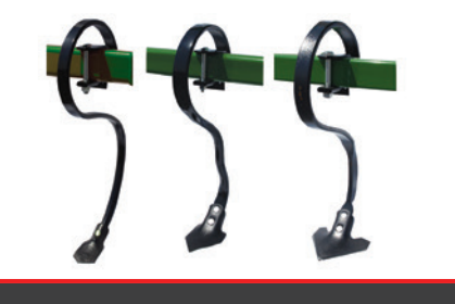
S-tines used on model 10: Model 12; Model 14