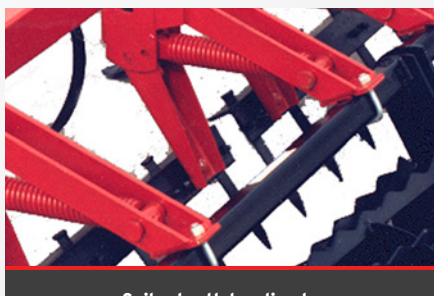
Spike-tooth leveling bar