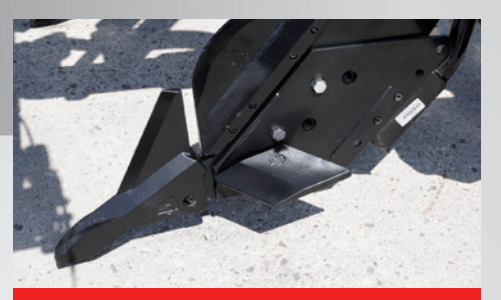
Optional shatter wings and shank protectors