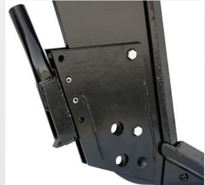
Dry fertilizer shank attachment