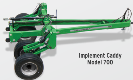
Implement Caddy Model 700