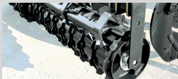
Cleated drum leveler