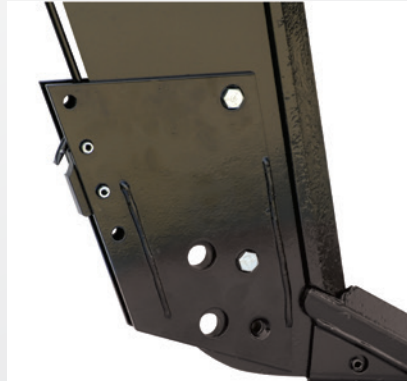
Liquid fertilizer shank attachment