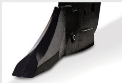
Wraparound steel points