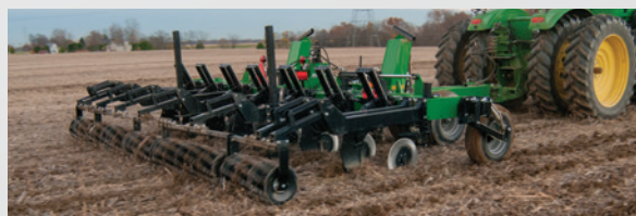
Rolling Harrow® conditioner