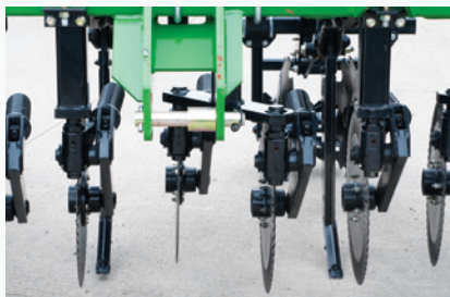
Double front coulters