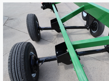
Rear tandem axle