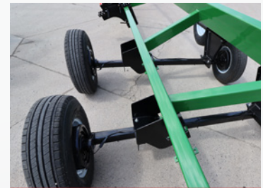
Rear tandem axle