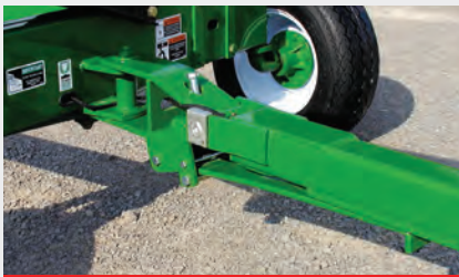
Spring-lift assist tongue