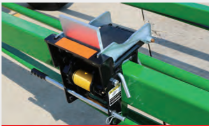
4-position rest bracket