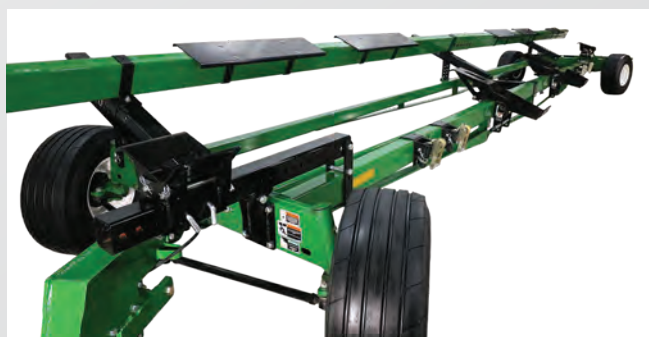
JD hinged draper package