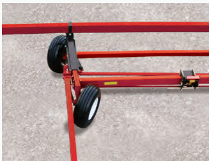
180° front steering