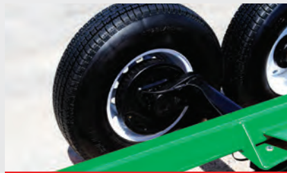
Available electric brakes