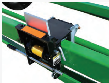
Tool-free, 4-way adjustable rest bracket