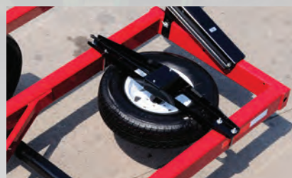
Optional spare tire