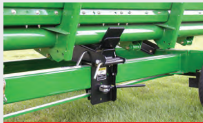
Standard tool-free, 4-way adjustable rest bracket