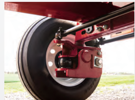
Optional rubber-cushioned suspension