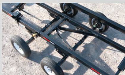
Adjustable rear axles

*Carrying capacities are rated at agricultural speeds.