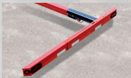
Width-adjustable LED light bar