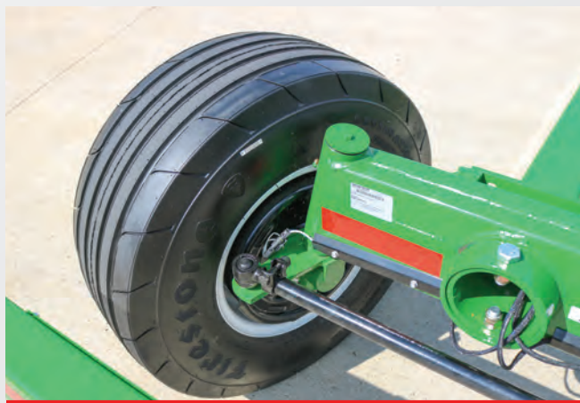
Optional 2- or 4-wheel brakes